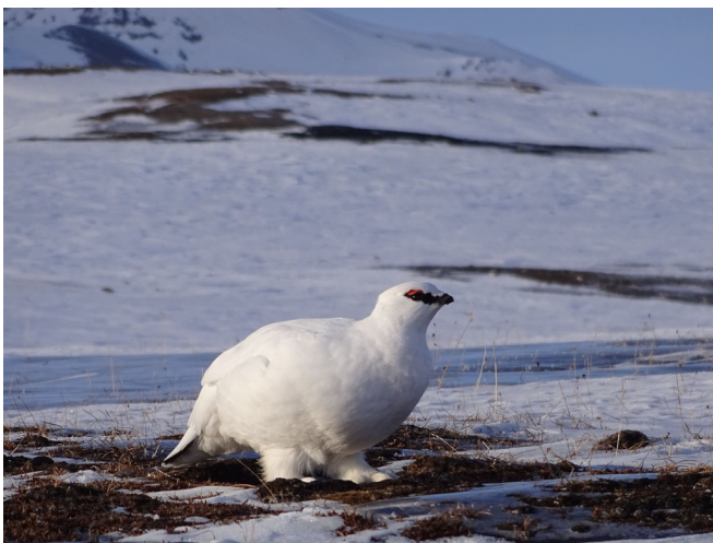
Fig. 1. Male Svalbard ptarmigan in winter plumage overlooking the slopes of the Arctowski mountain, Spitsbergen, Svalbard (78°12' N, 16°17' E) in early spring.