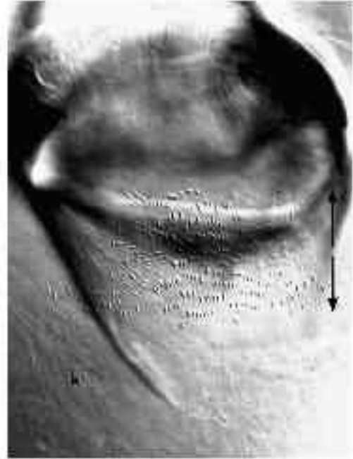
Fig. 3. Interference contrast picture of part of the ventral thorax of an embryo to show the naked - phenotype. Note the beard in T1 which shows oriented denticles as predicted by the gradient model (arrows) and the Keilin's organ ( k ). Anterior to top.

(Morata and Lawrence, 1975). Other segment polarity gene products might themselves be instrumental in cell affinities.