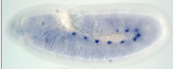
C wt; lbl intronic-LacZ