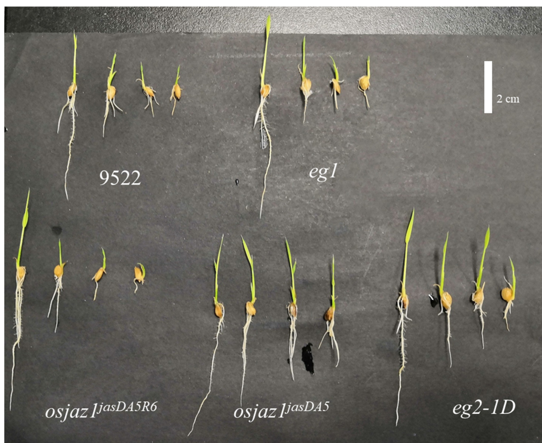
Figure S3. Phenotypes of root growth under 0, 5, 10 or 15 \mu M MeJA treatment

All the seeds were germinated and grown for 3 days and then treated with the different concentrations of MeJA for 5 days. Note that the root length is longer in osjazl jasDA5 and eg2-1D plants than in osjazl jasDA5R6 , egl and wild type 9522 under higher MeJA treatment. Scale bars=2 cm.