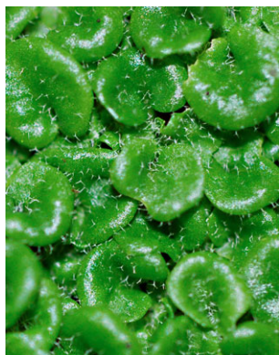
A close-up image of a lawn of bri1 ld Arabidopsis thaliana plants during early vegetative growth. This double mutant was used to establish the positive role of steroid signalling during the developmental transition towards reproductive growth. See research article by Domagalska et al. on p. 2841.