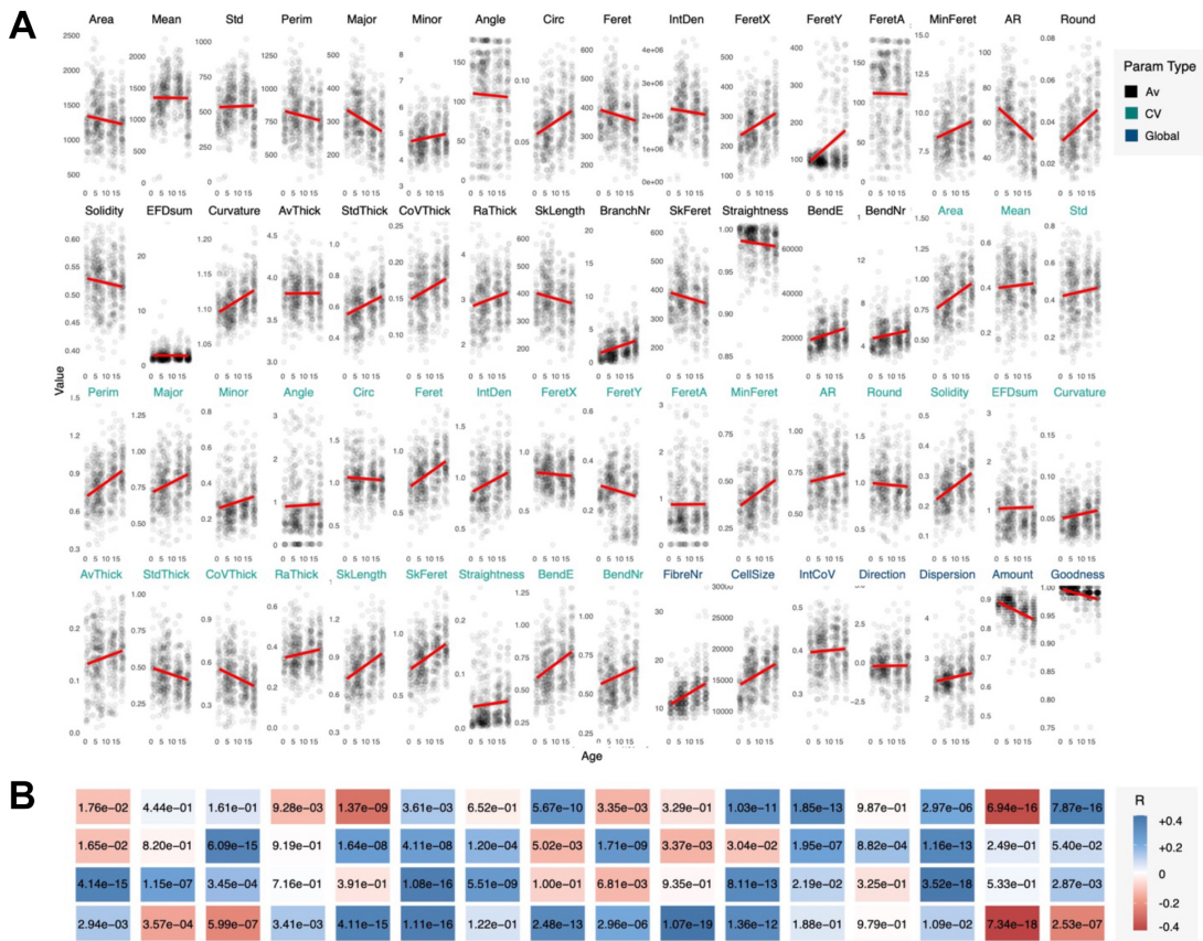
Fig. S2. Univariate regression of individual features as a function of chronological age. (A) Scatterplots of with linear regression line in red. (B) Color-coded correlation coefficients of the same parameters with their respective p-value.