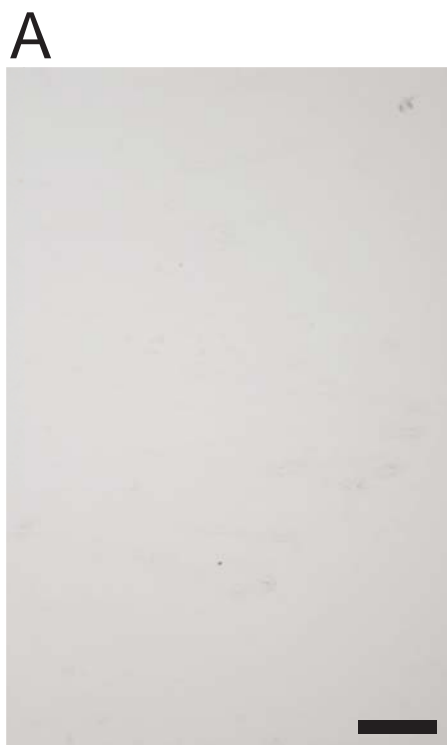
Sprr2f \alpha -sense D1 (diestrus)