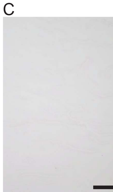
Sprr2f sense control D4 (estrus)