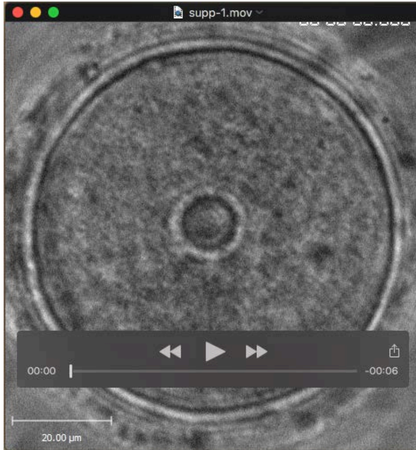
Movie 1. PB1 extrusion for control oocytes (a supplemental movie for Figure 5C)

Time-lapse live imaging experiment was used to analyze the timing of PB1 extrusion. In control oocytes, polar body extrusion was found at 11h (9 h post GVBD)