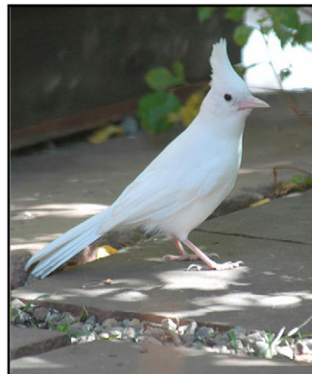
Fig. 1. Photograph of the amelanotic Steller's jay in Boulder County, CO, USA from which the feathers in this study were taken.

An Ocean Optics S2000 spectrometer (range 250–880 nm; Dunedin, FL, USA) was used to take reflectance measurements from these feathers. Feathers were placed on gloss-free black construction paper, and ~20 mm 2 patches of color approximately three-quarters of the feather's length away from the proximal end of each feather were chosen for analysis. Using a block sheath that excluded ambient light, a bifurcated micron fiber optic probe was held at a 90° angle 5 mm from the feather surface, creating a measurement area of 2 mm in diameter. This measurement area was illuminated by both a UV (deuterium bulb) and a visible (tungsten-halogen bulb) light source. All data were expressed relative to a white