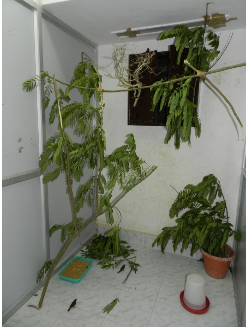
Fig. S3. Photograph of one chronocubicle (partly seen, not to size).