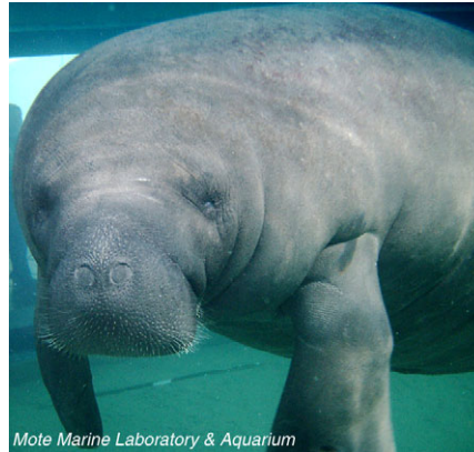
Mote Marine Laboratory & Aquarium

Grazing sea grass along the subtropical Florida coast, manatees would seem to have an idyllic life; that is until a passing motorboat shatters their peace. But motorboats and other watercraft pose an even greater threat, injuring the peaceable mammals with their propellers, or shattering their ribcages and puncturing their lungs in collisions. Joe Gaspard from the Mote Marine Laboratory and Aquarium, USA, explains that it isn't clear why the animals are so vulnerable to human activity. Although their vision is known to be extremely restricted in the turbid water, Gaspard points out that sound is absorbed less in water than in air, potentially allowing it to travel farther. It also travels five times faster in water than in air, theoretically warning the animals earlier of an approaching threat. However, it wasn't clear whether manatees have the ability to hear looming watercraft above the cacophony of their natural environment. Teaming up with Gordon Bauer, Roger Reep and David Mann, and a group of trainers from the aquarium, Gaspard decided to test the hearing of two captive manatees, Buffett and Hugh, to find out what they are capable of hearing (p. 1442).