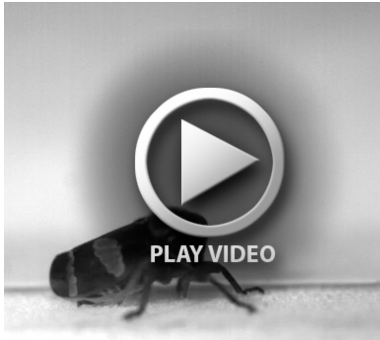
Movie 1. A jump by Pauroeurymela amplicincta captured at 5000 frames s^{-1} and replayed at 10 frames s^{-1} . The insect is viewed from the side as it jumps from the floor of the experimental chamber. See Fig. 3.