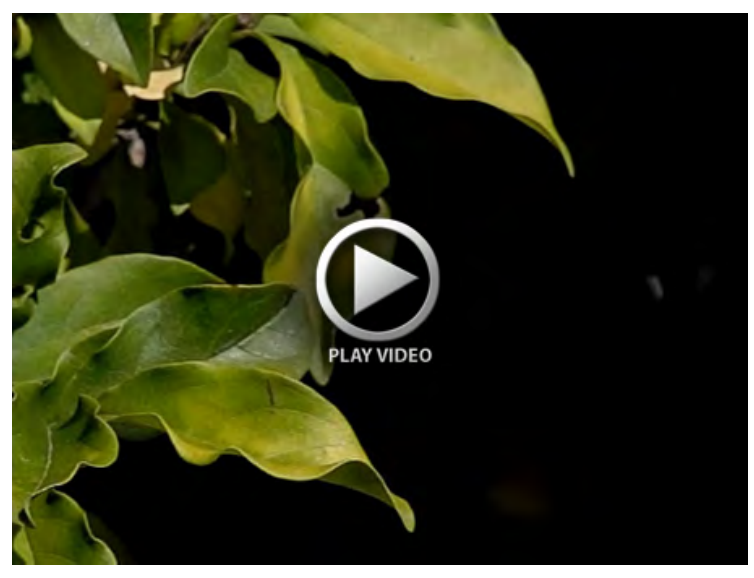
Movie 1. Example sequence 1 of male wasps facing Magnolia leaves during a patrolling flight. Filmed at 300 frames s<sup>-1</sup>.