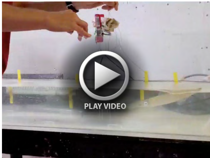
Movie 1. Escape jet. Two escape jets performed by an adult Doryteuthis pealeii . The sonomicrometry transducer leads are visible in the experimenter's hand.