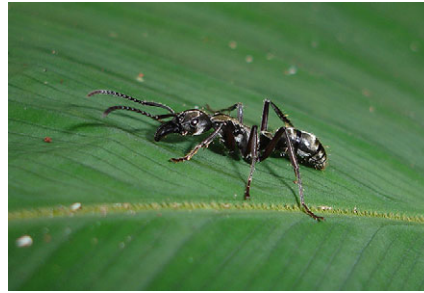
Pachycondyla sp., a tropical swimming ant.