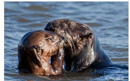
Southern sea otter mum and pup.

Sea otters have voracious appetites, and for good reason. As the smallest marine mammals, they face unprecedented metabolic challenges just to stay warm, consuming a quarter of their own body mass each day. And there are times when the metabolic demands of sea otter females rocket even further. Nicole Thometz, from the University of California at Santa Cruz, USA, explains that in addition to the extra cost of lactation, the mums must also expend additional energy while foraging to sustain themselves and their dependents. However, no one knew the true magnitude of the metabolic burden placed on sea otter mothers: 'neither the energetic demands of immature sea otters nor the cost of lactation for adult females have been quantified', says Thometz. Fortunately, Thometz and her colleagues had access to the world's most successful sea otter pup rehabilitation program at the Monterey Bay Aquarium in California, where they could measure the metabolic rates of wild sea otter pups while they grew, prior to their return to the ocean, to begin to find out how much of a burden motherhood is for sea otter females (p. 2053).