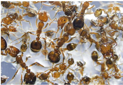
A network of fire ants.

For red fire ants ( Solenopsis invicta ), rain gently drumming on the ground is the trigger for a mass exodus. Streaming from their nest as the water levels rise, the ants rapidly assemble and grip onto their nearest neighbours, forming a raft to carry them to safety. What is more miraculous is that each individual ant is denser than water and in danger of sinking if submerged. However, the ants don't just draw the line at constructing rafts: they routinely form bivouacs, assemble towers and even coalesce into droplets when swished in a cup. 'You can consider them as both a fluid and a solid', explains David Hu from the Georgia Institute of Technology, USA, who is most interested in the ants because they are large enough for him to begin to find out how they interact to pull off these remarkable engineering feats. Hu teamed up with Paul Foster and Nathan Mlot to investigate how balls of living fire ants self-assemble (p. 2089).