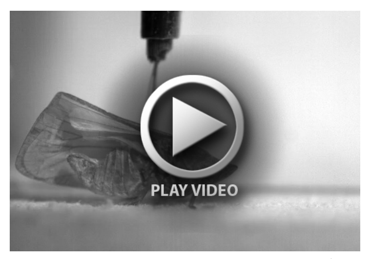
Movie 3. A side view of a jump by Colgar peracutum captured at 5000 frames s<sup>-1</sup> and replayed at 10 frames s<sup>-1</sup> as it jumped from the floor of the experimental chamber. The right front wing was removed. See Fig. 7.