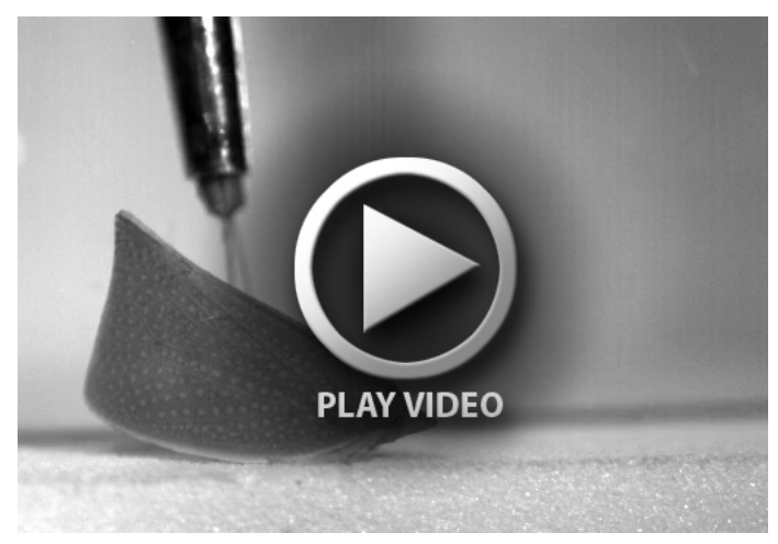
Movie 1. A jump by Siphanta acuta captured at 5000 frames s<sup>-1</sup> and replayed at 10 frames s<sup>-1</sup>. The insect is viewed from the side as it jumped from the floor of the experimental chamber. See also Fig. 6.