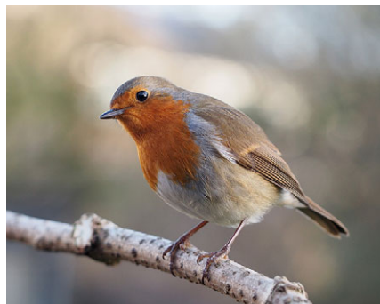
European robin ( Erithacus rubecula).