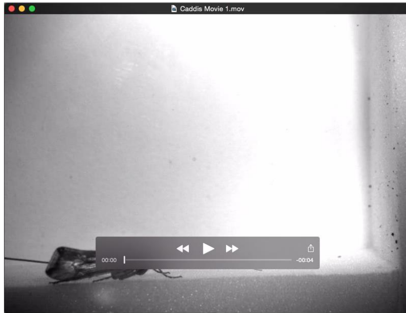
Movie 1. Side view of Limnephilus marmoratus captured at 1000 frames s^{-1} and replayed at 10 frames s^{-1} , as it jumped from the floor of the experimental chamber. This is a jump in which the wings were not opened before take-off. See also Text Figure 3.