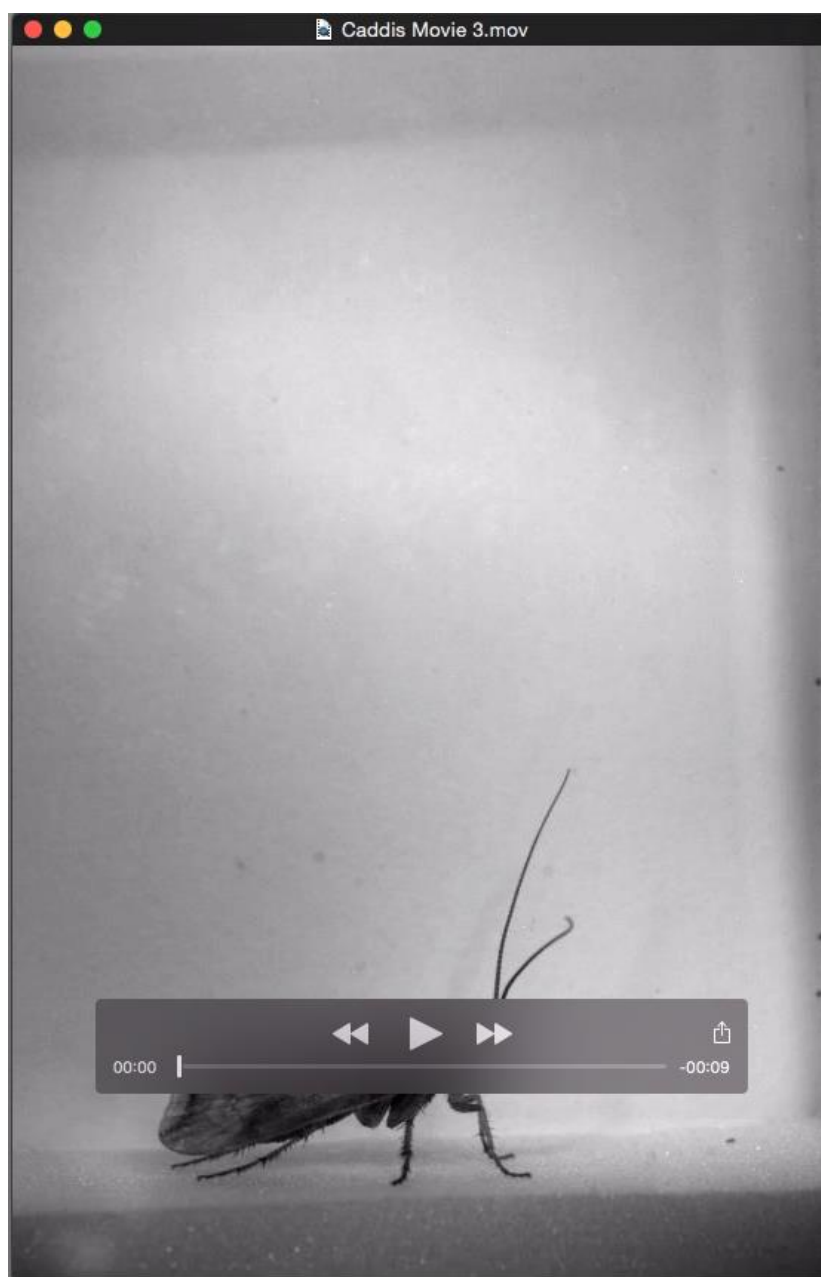
Movie 3. Side view of Limnephilus marmoratus captured at 1000 frames s^{-1} and replayed at 10 frames s^{-1} , as it jumped from the floor of the experimental chamber. This is a jump in which both the wings and legs contributed to take-off. See also Text Figure 8.