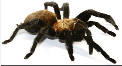
Texas brown tarantula ( Aphonopelma hentzi ).

Scuttling across the floor, a spider's movements have more in common with robots than you may at first realise. Instead of contracting muscles to extend a limb, spiders inflate their joints with haemolymph to straighten them – in much the same way that hydraulic fluid propels robot limbs. And temperature fluctuations may affect the movements of spiders and robots alike: fluid viscosity can increase dramatically as temperature falls, prompting undergraduate Nick Booster from Pitzer College, USA, to ask whether spider movements are affected by temperature change. 'I've always wanted to study spiders because they use hydraulics', says Anna Ahn from Harvey Mudd College, USA, so when Booster approached Ahn and Steve Adolph with his idea to study the effects of temperature on the arachnid's movements, they jumped at the chance. 'This is a fascinating question', Ahn chuckles, adding, 'We wanted to understand how temperature affects the haemolymph and whether impaired haemolymph movement might influence the spiders' ability to run'.