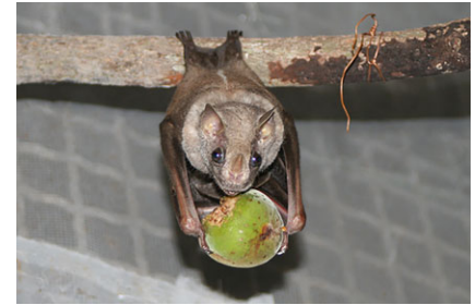
Chiroderma villosum, hairy big-eyed bat, eating a fig.