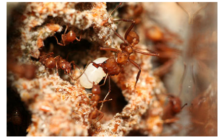
Acromyrmex octospinosus leafcutter ant fungus chamber.