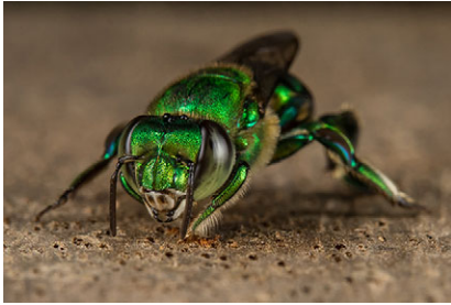
A male Euglossa tridentata collecting at an artificial scent source.