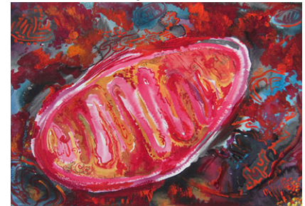
A mitochondrion (watercolour and tempera). Image credit: Inna Sokolova.

Few terrestrial animals ever experience hypoxia (when oxygen is scarce), but spells of low oxygen availability are routine for creatures clinging to life on the seashore: ‘Diurnal cycles of respiration and photosynthesis in the coastal zones commonly lead to O 2 swings from near-anoxia during the night to hyperoxia during the day’, says Inna Sokolova from the University of North Carolina at Charlotte, USA. Yet, many of these creatures can withstand periods of oxygen deprivation lasting weeks and even months. Sokolova explains that several of the mechanisms that underpin the coast dwellers’ survival are already known, including the use of alternative mechanisms to generate ATP and the animals’ ability to drop their metabolic rate to conserve energy. However, Sokolova explains that little was known about how these resilient species protected the essential mitochondria – which consume oxygen to generate ATP – from the damaging effects of oxygen deprivation.