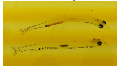
Two delta smelt.