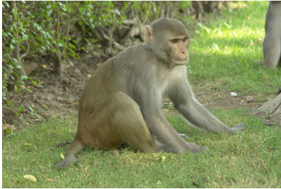
Rhesus macaque, Red Fort, Agra, India.