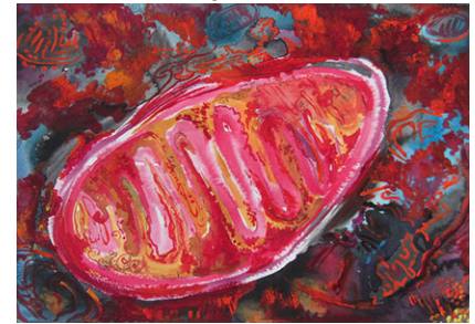
A mitochondrion (watercolour and tempera). Image credit: Inna Sokolova.

Few terrestrial animals ever experience hypoxia (when oxygen is scarce), but spells of low oxygen availability are routine for creatures clinging to life on the seashore: ‘Diurnal cycles of respiration and photosynthesis in the coastal zones commonly lead to O 2 swings from near-anoxia during the night to hyperoxia during the day’, says Inna Sokolova from the University of North Carolina at Charlotte, USA. Yet, many of these creatures can withstand periods of oxygen deprivation lasting weeks and even months. Sokolova explains that several of the mechanisms that underpin the coast dwellers’ survival are already known, including the use of alternative mechanisms to generate ATP and the animals’ ability to drop their metabolic rate to conserve energy. However, Sokolova explains that little was known about how these resilient species protected the essential mitochondria – which consume oxygen to generate ATP – from the damaging effects of oxygen deprivation.