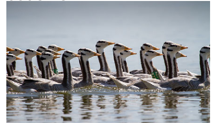
Bar-headed geese, China.

When it comes to feats of extreme endurance, bar-headed geese leave most animals in their wake – even other birds. Migrating back and forth across the Himalayan Mountains from their northern nesting grounds to overwinter in South Asia, the large birds have to sustain flight – one of the most metabolically demanding activities – at altitudes where oxygen is scarce. Sabine Lague and colleagues from the University of British Columbia and Queen’s University, Canada, explain that most birds are well equipped to deal with the metabolic demands of flight, and bar-headed geese have souped-up systems to ensure that they deliver sufficient oxygen to their toiling flight muscles in the thinnest of air. However, the team explains that most of our understanding of the physiology of these extreme aviators is based on observations of animals raised at sea level; yet, the true athletes are born and raised at altitudes of over 3000 m on the Tibetan and Mongolian plains.