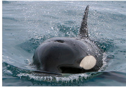
A killer whale surfacing.