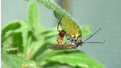
Hyposoter horticola wasp laying eggs in Melitaea cinxia eggs.

Evil parasites are the stuff of horror movies, bursting out of unsuspecting victims in the most ghoulish fashion possible. However, it seems that even parasites are not immune to parasites of their own. Anne Duplouy, Saskya van Nouhuys and Minna Kohonen from the University of Helsinki, Finland, describe how Hyposoter horticola parasitic wasps, which exclusively target Granville fritillary butterfly caterpillars – on the Åland Islands off Finland – are susceptible in turn to Mesochorus cf. stigmaticus hyperparasitic wasps, which hijack H. horticola larvae as incubators for their own offspring. However, Duplouy had also noticed previously that H. horticola populations had lower levels of M. cf. stigmaticus infection where H. horticola had high rates of infection by the symbiotic Wolbachia bacteria (doi: 10.1371/journal.pone.0134843). Explaining that Wolbachia infections are often beneficial to their hosts in order to maintain their welcome, Duplouy wondered whether the bacteria also boosted the resistance of H. horticola to M. stigmaticus hyperparasitic lodgers – consequently reducing M. cf. stigmaticus infection rates when Wolbachia infection rates are high. However, there was an alternative explanation for low levels of M. cf. stigmaticus infection: if Wolbachia reduced the resistance of H. horticola to M. cf. stigmaticus , this would allow M. stigmaticus to kill off Wolbachia -infected H. horticola to keep their numbers down when M. cf. stigmaticus infection rates were high.