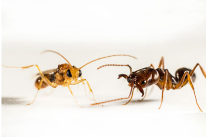
A male (left) and a worker (right) Odontomachus ruginodis ant.