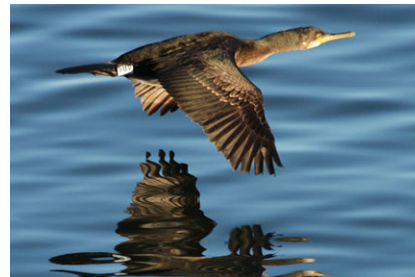
Shag in flight.