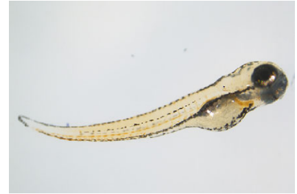
A zebrafish larva.

Few animals are born fully equipped to deal with the world. Most continue developing after birth, and for a zebrafish larva, one of the key structures that is thought to undergo massive changes during the earliest weeks of life is the lateral line system. ‘The lateral line is how fish sense water flow’, explains Matt McHenry, from the University of California Irvine, USA, who adds that the sensory system may allow peckish larvae to detect swirls in the water produced by juicy water fleas sweeping past. ‘If you have the ability to feed in the dark or in dim, turbid conditions... then you have a great advantage’, says McHenry. Wondering if the ability of zebrafish larvae to forage in the dark improved as their flow-sensitive lateral line system developed, McHenry and graduate student Andres Carrillo began testing how zebrafish youngsters coped with catching live meals when the lights went out.