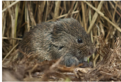
Tundra vole ( Microtus oeconomus).