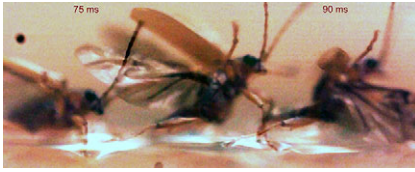
Time-lapse image of Galerucella nymphaeae flying on the water surface.