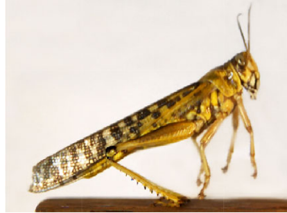
Male gregarious locust ( Schistocerca gregaria ) jumping.

Of all the biblical plagues, locusts are probably the most infamous. Stripping vegetation bare and devastating crops, an advancing swarm can decimate thousands of hectares in a single day. Explaining that locusts exist in one of two forms – the benign solitary locust and the voracious gregarious locust – Stephen Rogers from Arizona State University, USA, says that field workers monitor how far solitary locusts have progressed on their transformation into swarming gregarious locusts by measuring the length of the insects' hind legs: adult solitary locusts have longer femurs than adult gregarious locusts. Recalling a discussion during a meeting when he was in Malcolm Burrows' lab in Cambridge, UK, Rogers says, 'We were mulling over things to do and we said, "We have these morphological differences that are used by the field workers, but we have no idea why they are there and what they mean for the biology of the animal"'. So, the team decided to get to grips with why solitary locusts are leggier.