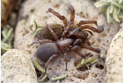
A ground spider subduing a larger wolf spider.