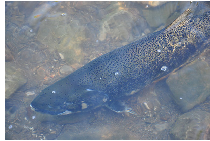
A Chinook salmon.

Life is beset with competition, from the sprint for victory to a tasty morsel to stylish preening to attract mates, but one of the most fundamental contests must occur in the microscopic realm where fish sperm battle to penetrate an egg first. 'Males often exhibit different tactics to increase their reproductive success', says Ian Butts, from Auburn University, USA. Some male fish pass themselves off as females to outsmart rivals guarding harems, while others try sneaking behind opponents' backs. Small Chinook salmon males – known as 'jacks', which return to the river of their birth a year or two before older and more aggressive hooknose males – invest more energy in their sperm and gonads in a bid to outcompete their larger counterparts. Might the young males' increased investment also be reflected in their sperm's athleticism? In addition, ovarian fluid released when female Chinook salmon expel their eggs alters the viscosity, pH and salt concentration of the water into which the males' sperm is released. Working together as part of Trevor Pitcher's long-term study of Chinook spawning