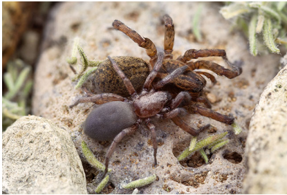
A ground spider subduing a larger wolf spider.