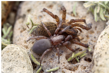
A ground spider subduing a larger wolf spider.