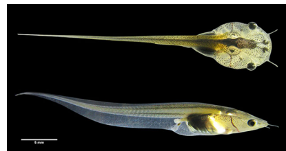
One-month-old Xenopus tadpoles.

Some photographers take advantage of the blurring effect produced when animals and humans move past the lens at high speed to produce extraordinary images, but if animals didn't have a sophisticated system – the optokinetic reflex – to stabilise their vision while mobile, this smeary perspective would be our permanent reality. Céline Gravot, from the Ludwig-Maximilians-Universität München, Germany, explains that most animals swivel their eyes in their heads to counteract the effects of motion: 'You can experience this reflex when looking out of the window of a moving train; your eyes will move to follow the movement of the scene outside', she says. But Gravot and her colleagues Alexander Knorr, Stefan Glasauer and Hans Straka were curious to find out how the swivelling motion of the eye responds to specific features of a scene. For example, would the reflex movement respond in the same way to dark objects – such as a flock of birds or squadron of planes – silhouetted against bright daylight as it does to brilliant stars against a dark sky?