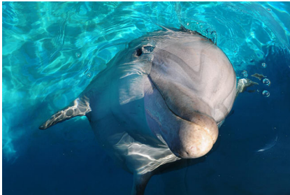
A dolphin that participated in the study.

Surviving in an environment that actively impedes your progress can leave you vulnerable during an escape; couple this with the need to conserve limited oxygen reserves and the magnitude of the challenges faced by many cetaceans when threatened becomes clear. ‘Amazingly, there has been only a handful of studies that have actually measured the energetic cost of a dive for dolphins or whales’, says Terrie Williams, from the University of California Santa Cruz, USA, who is fascinated by how marine mammals balance their energy demands with their finite oxygen supply. Explaining that fleeing dolphins beat their fins continually when swimming full-out, while adopting a more leisurely burst-and-glide style during a routine dive, Williams wondered just how much energy each swimming style uses and how much energy a startled animal may use when evading peril.