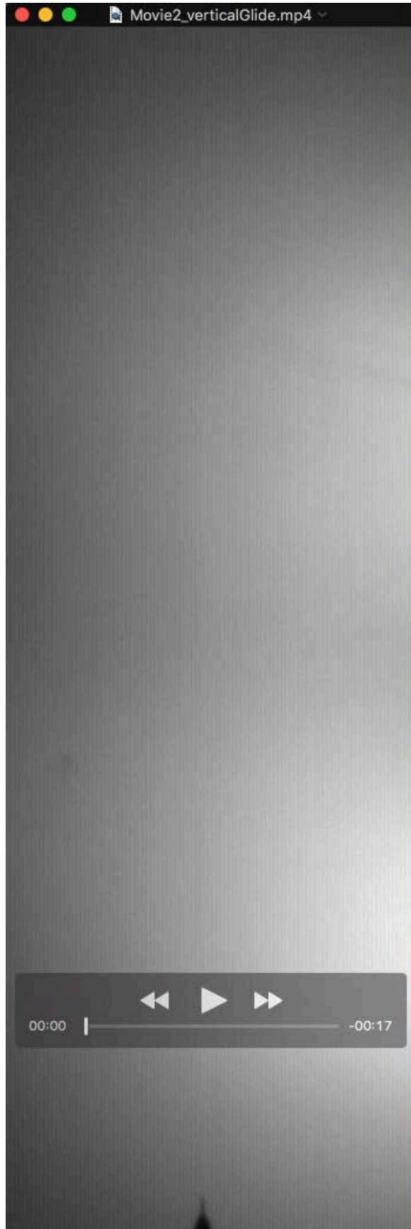
Movie 2. Ascending Anna's hummingbird adopting a ballistic posture with folded wings upon cessation of flapping.