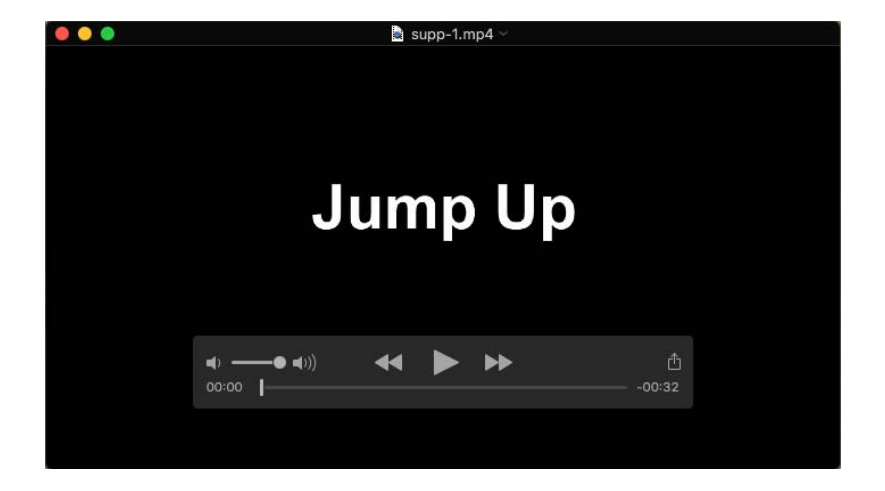
Movie 1. An example of how peahens direct their attention when they jump up and down a perch. The upper left video displays the field of view of the left eye as well as an insert of the left eye. The upper right video displays the field of view of the right eye as well as an insert of the right eye. The magenta dots indicate where the peahens are gazing within each field of view and the circle surrounding them indicates a 10° radius around the point of gaze. The lower left video displays multiple views of the experimental room.