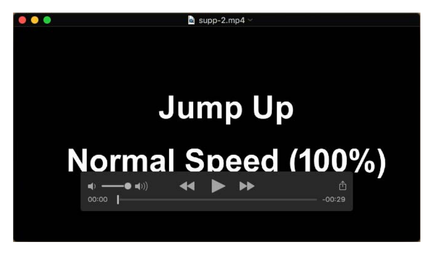
Movie 2. A peahen's head and body are roughly aligned when jumping on the perch.