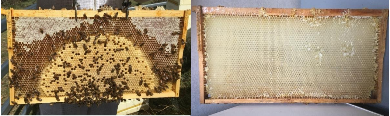
Figure S1. Brood frame (left) and frame with wax comb used to replace brood frame (right)