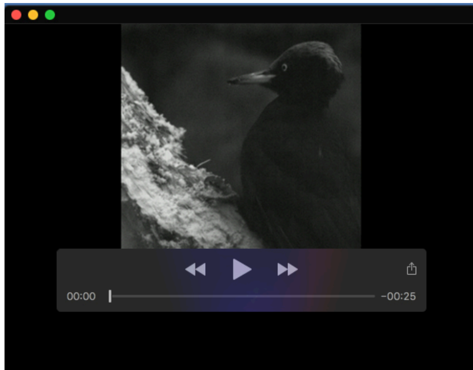
Movie 1. Slow-motion replays of high-speed videos showing the characteristic beak movement pattern during head retraction in Dryocopus martius .