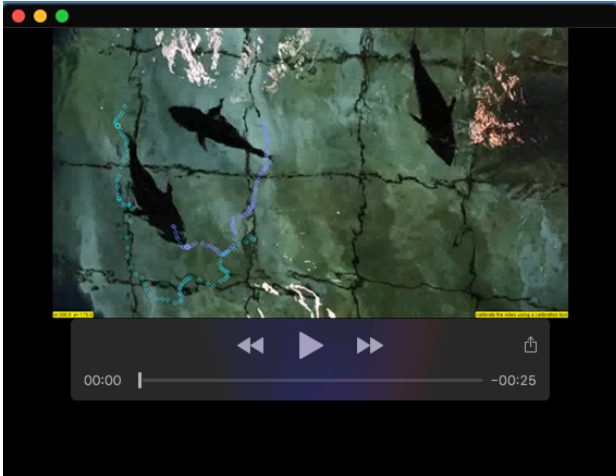
Movie 1. Glide turn in which the caudal fin is used as a rudder. The blue diamonds and green diamonds show the sequential positions of rostrum and caudal fin through the turn, respectively.